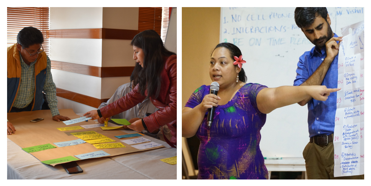
AG-Scans in action in Boivia (left) and Samoa (right)